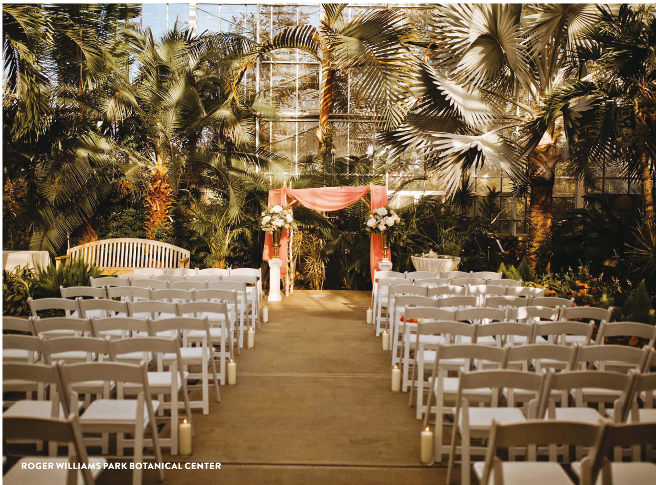
ROGER WILLIAMS PARK BOTANICAL CENTER